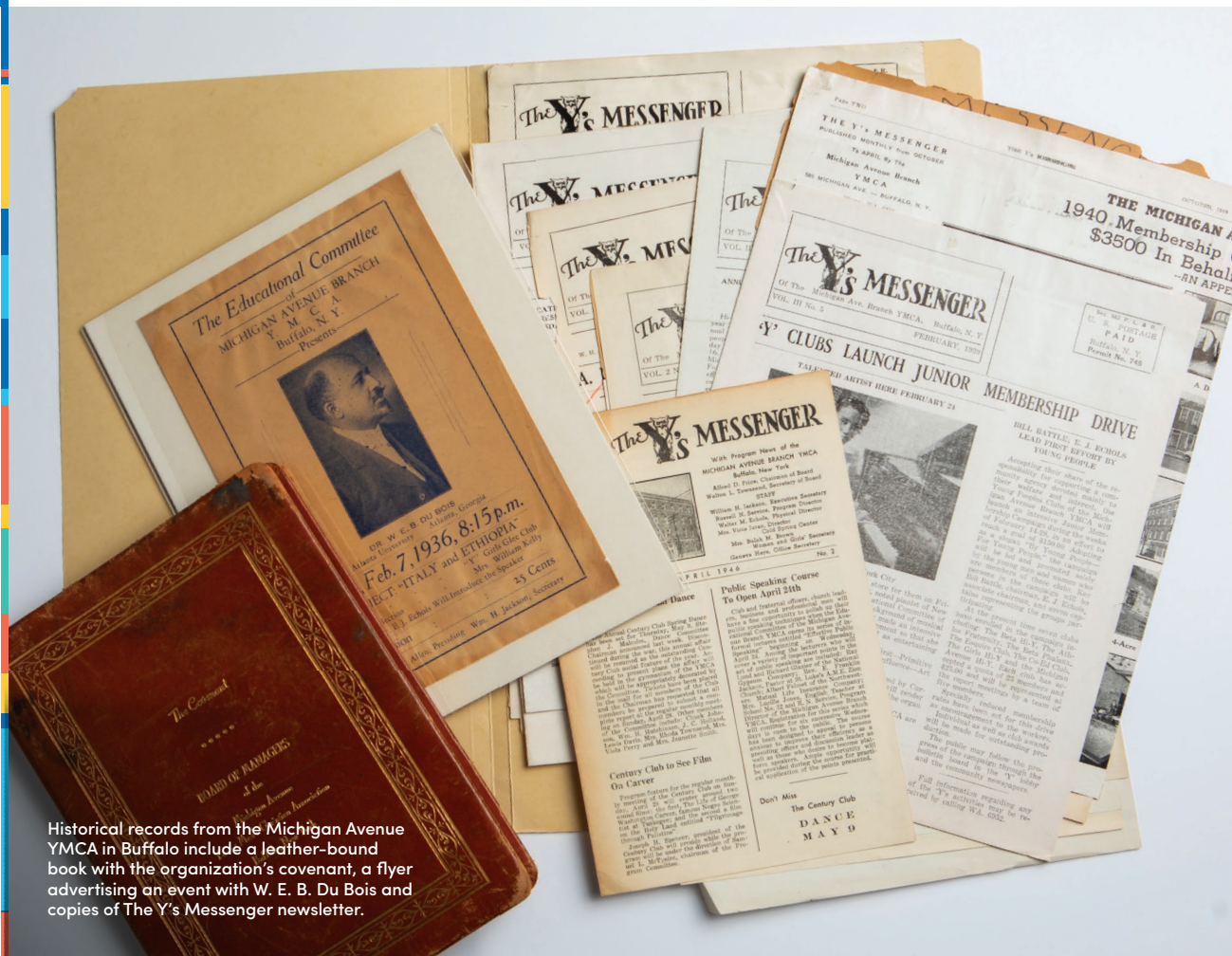
Historical records from the Michigan Avenue YMCA in Buffalo include a leather-bound book with the organization's covenant, a flyer advertising an event with W. E. B. Du Bois and copies of The Y's Messenger newsletter.

Herbs and more flourish in South Campus garden