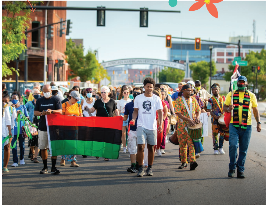
A "Freedom Walk" along Michigan Ave., the kickoff for the Igniting Hope conference in August, symbolized the togetherness of people in the community.

Last summer's Igniting Hope conference kicked off with a two-mile "Freedom Walk" from the Michigan Street African American Heritage Corridor archway to the Freedom Wall at the corner of Michigan Avenue and East Ferry Street. The conference is an annual summit that brings together community members, researchers and other stakeholders to better understand racial disparities in health care.