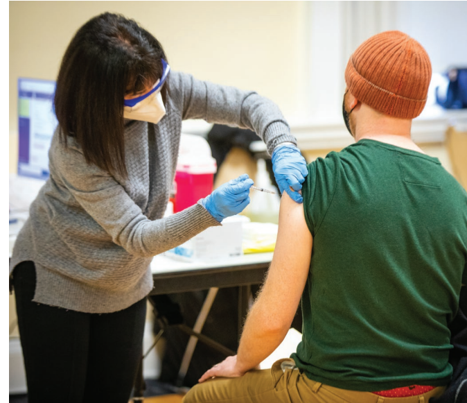
The New York State-run vaccination site in UB's Harriman Hall on the South Campus has been providing COVID-19 vaccinations to the community since January of 2021.

A note from UB's Office of Government and Community Relations